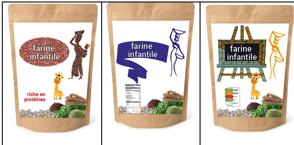
Figure 1: Examples of images of child food packaging used in conjoint analysis

shown (Figure 1). The porridge ingredients were the same on each packaging design and thus are not included in the conjoint study.